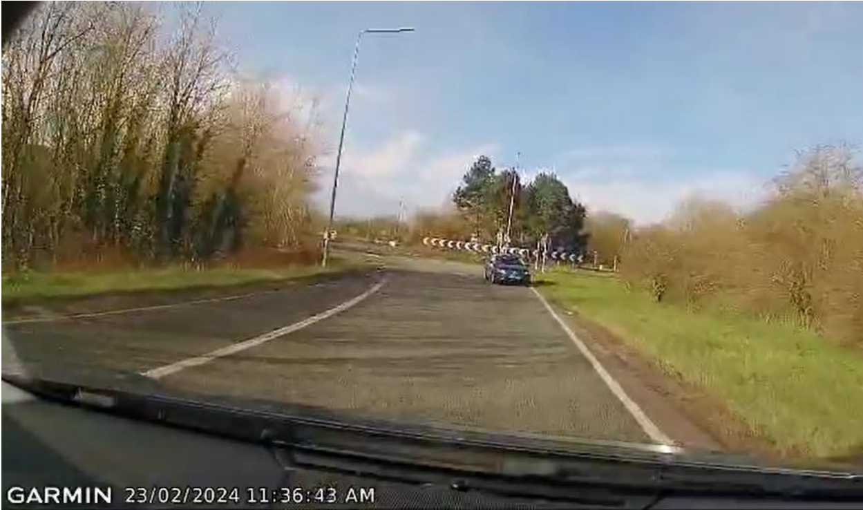
Appendix 1 - Image from Dashcam showing vehicle travelling up the slip road on 23/02/24